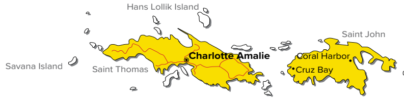
U.S. Virgin Islands