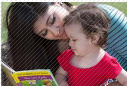
1994 Denver, CO 735 Large proportion of Hispanics Nurses and paraprofessionals

comparing the short- and long-term outcomes of mothers and children enrolled in the Nurse-Family Partnership program to those of a control group of mothers and children not participating in the program.