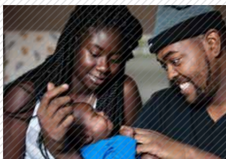
1990 Memphis, TN 742 Low-income blacks Urban area