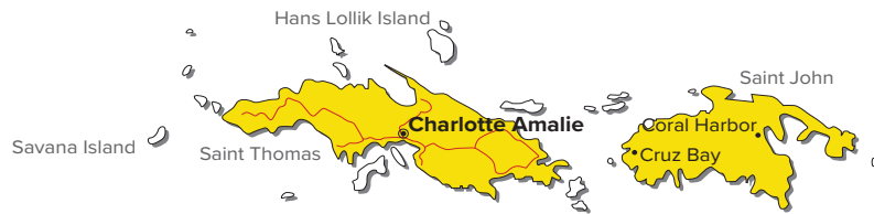
U.S. Virgin Islands