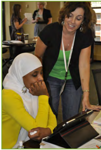
New nurse home visitors attend NFP Core Education sessions in Denver in July.

Nursing trade publications have taken note of Nurse-Family Partnership's efforts in recent coverage of NFP in AORN Journal, ADVANCE for Nurses and others. (Visit the NFP in the News section on the NFP website to read the articles.)