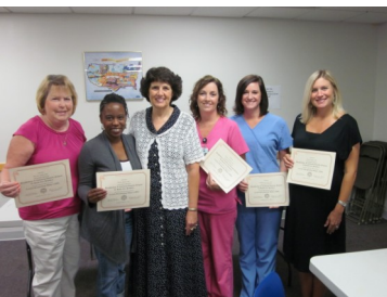
Anderson team with their certificates.