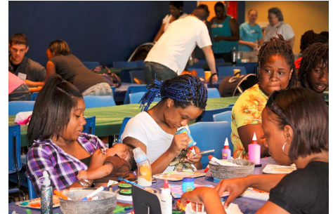
Clients and their families visit with one another during the event.