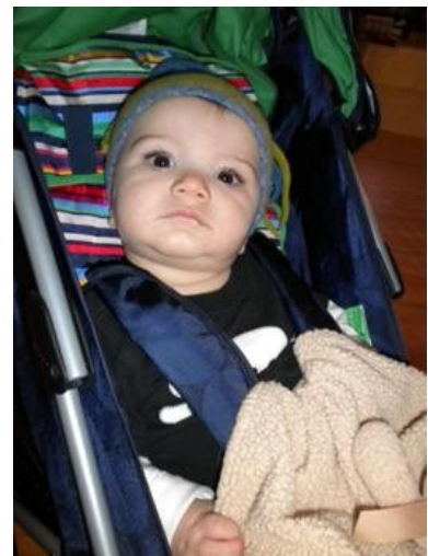
Through the expansion, more North Carolina children will benefit.

Community grants will become available this fall and will end in September 2012 with the option to renew for two years, pending the availability of federal funds.