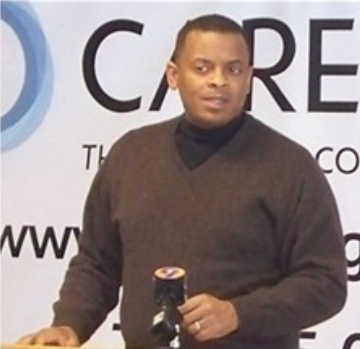
Mayor Anthony Foxx addresses audience and media at Mecklenburg County NFP's two-year anniversary.

On June 21, Charlotte Mayor Anthony Foxx addressed 150 attendees at the 2011 Mecklenburg County Medical Society Annual Meeting. The topic was “The Future of Charlotte’s Economy.” During his remarks Mayor Foxx shared his support for NFP, citing its economic value and positive impact on at-risk families in Mecklenburg County. NFP’s support base continues to grow through community outreach and educational events such as this one.